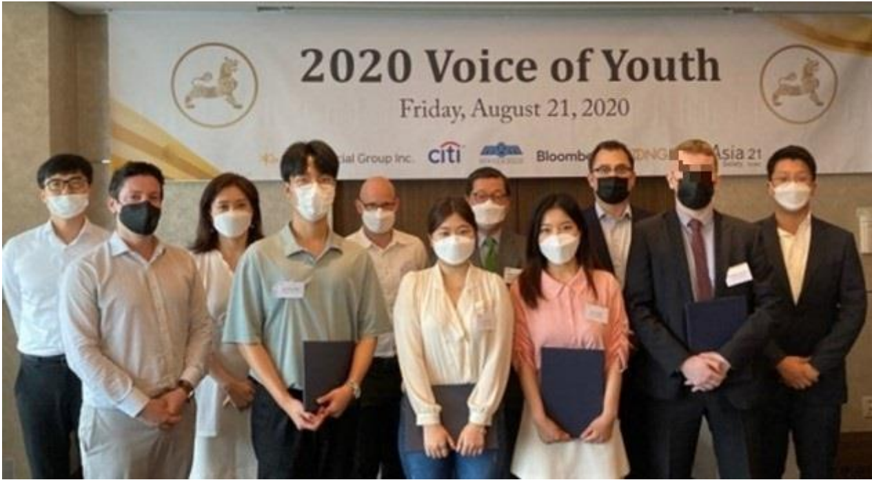
2020 Voice of Youth Participants and Judges

Asia Society Korea held its third annual "Voice of Youth" Research Presentations on Friday, August 21, 2020. Many competitive applicants submitted their preliminary research plans, from which four finalists were ultimately chosen to develop their work over the past six months.