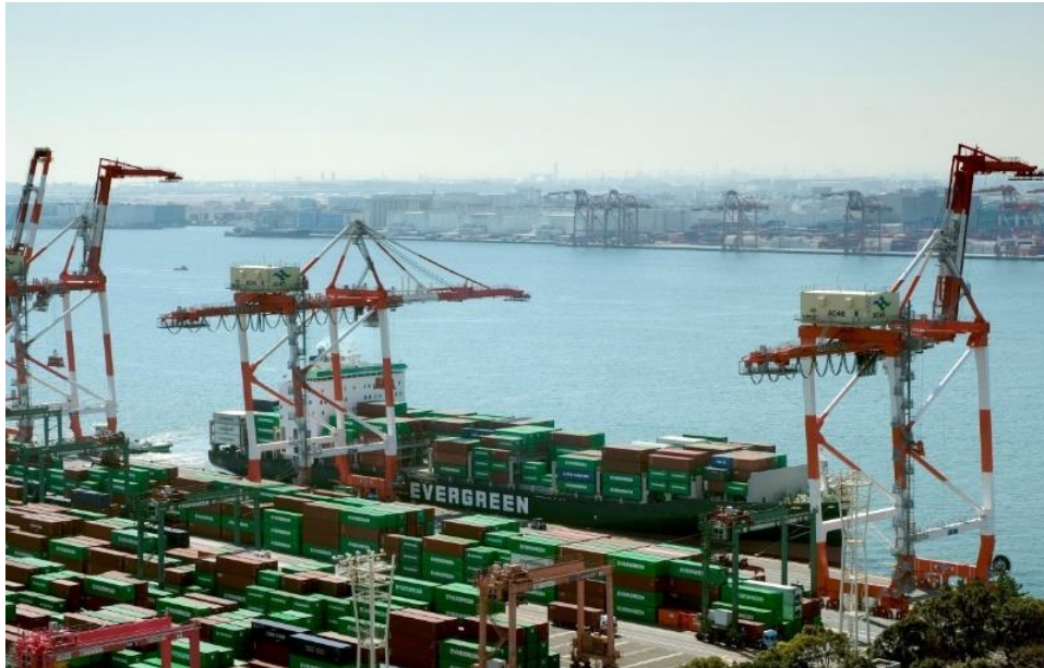
Containers are seen at the international cargo terminal at the port of Tokyo.

본 글은 아시아사이어티 정책연구소 (ASPI) 웬디 커틀러 (Wendy Cutler) 부소장이 2020년 5월 20일 더힐(The Hill)에 기고한 글입니다.