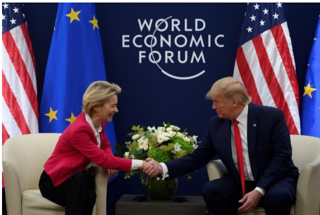
US President Donald Trump shakes hands with European Commission President Ursula von der Leyen prior to their meeting at the World Economic Forum in Davos, on January 21, 2020.

세계는 현재 미국, 유럽, 중국간 새로운 관계의 변화를 직면하고 있으며, 이는 COVID-19으로 인해 더욱 가속화되고 있다. 또한, 대서양 연안 국가간 관계가 악화되면서, 중국은 공격적인 ‘늑대 외교’, 상업주의적 무역행보, 그리고 중국 내 사회 규제 강화 등 더욱 확고한 입장을 내비치고 있다. 이러한 흐름은 중국에 대한 미국과 유럽의 인식과 교류 방식을 크게 변화시켰다. 중국의 변화가 대서양 연안 내 국가 관계에 어떠한 영향을 끼칠까? 또한, 대서양 연안 국가 정부, 전문가, 그리고 시민사회들이 어떻게 중국이 제기하는 도전에 대하여 긴밀한 합의점을 도출해 낼 수 있을까?